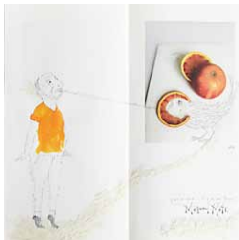
Carnet 03 (Mars) // Megumi Terao