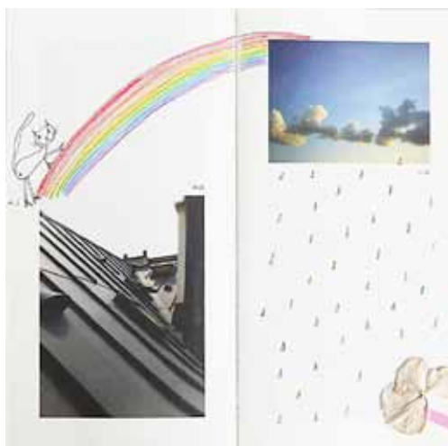
Carnet 06 (Juin) // Masae Takanaka